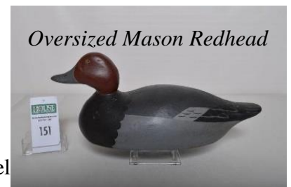
Oversized Mason Redhead