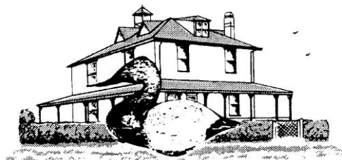
Home of Back Bay Wildfowl Guild, Inc.

This Monday the meeting will be a dinner meeting at the Lucky Oyster Restaurant. In addition to good food and fellowship there will be raffles for baskets and other items to serve as a fund raiser for the Guild.